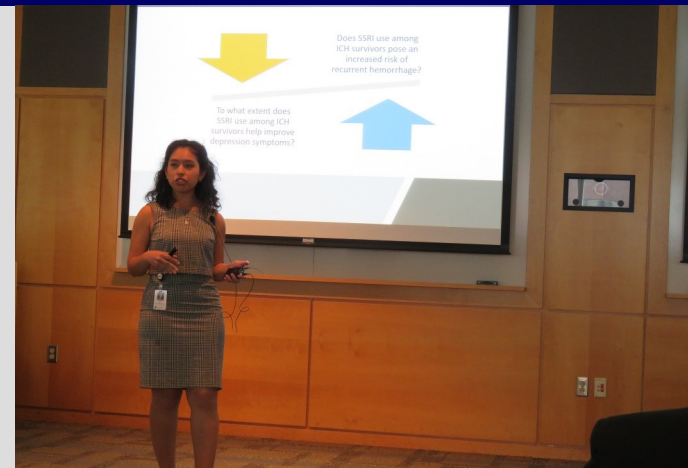
2019 SRTP Student during the Final Presentation