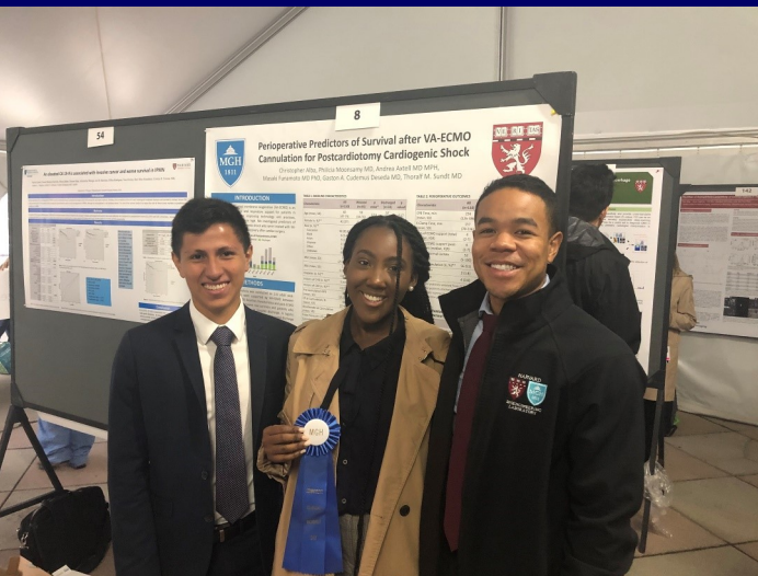
2019 SRTP Students presenting at MGH Research Day