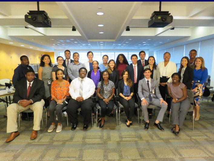
2019 SRTP students